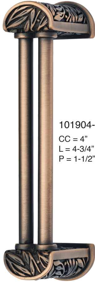
101904-TZ CC = 4" L = 4-3/4" P = 1-1/2"