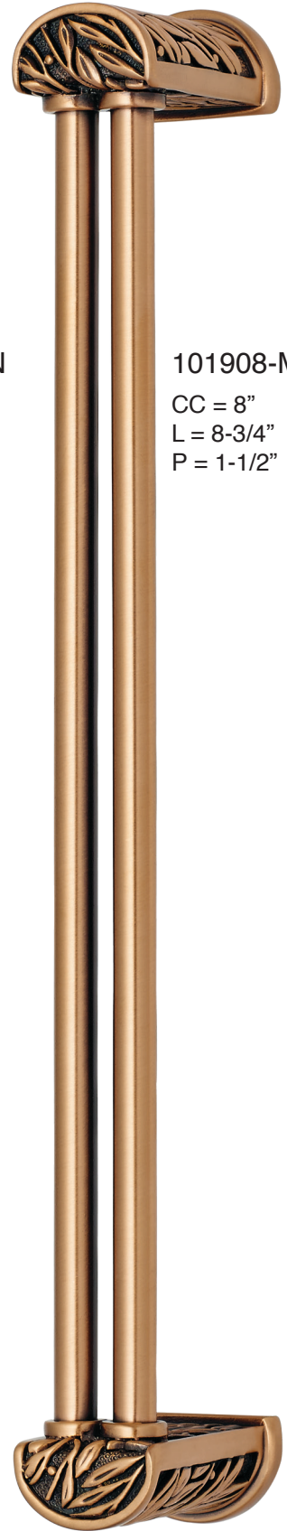
101908-MG CC = 8" L = 8-3/4" P = 1-1/2"