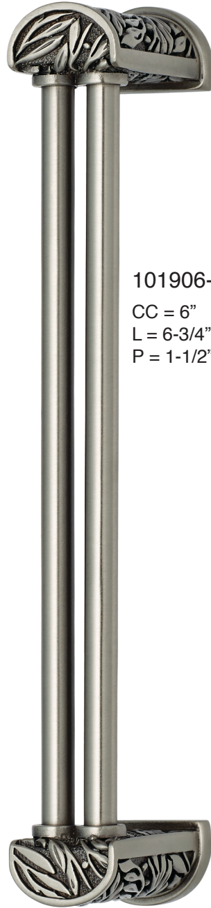
101906-AN CC = 6" L = 6-3/4" P = 1-1/2"